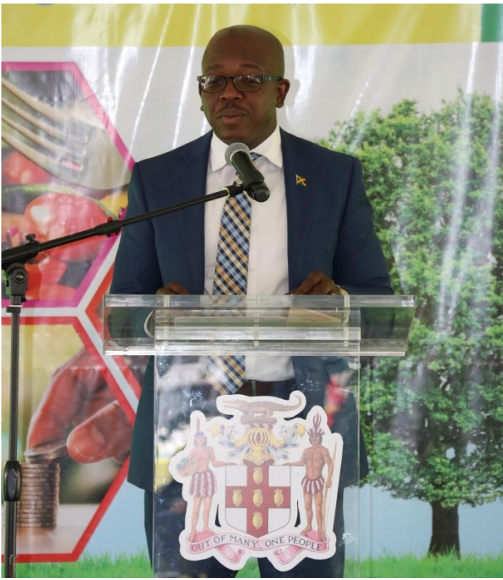
Minister Charles, Ministry of Agriculture giving the main address on May 12 at Jamaica's celebration of IDPH