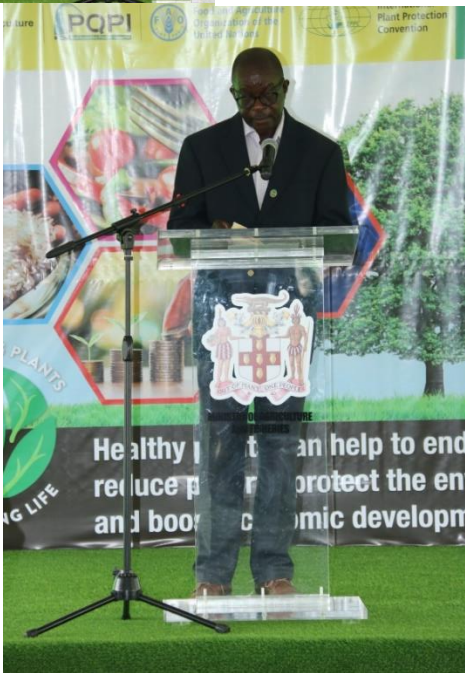
CARDI Representatives bringing greetings on May 12 at Jamaica's IDPH