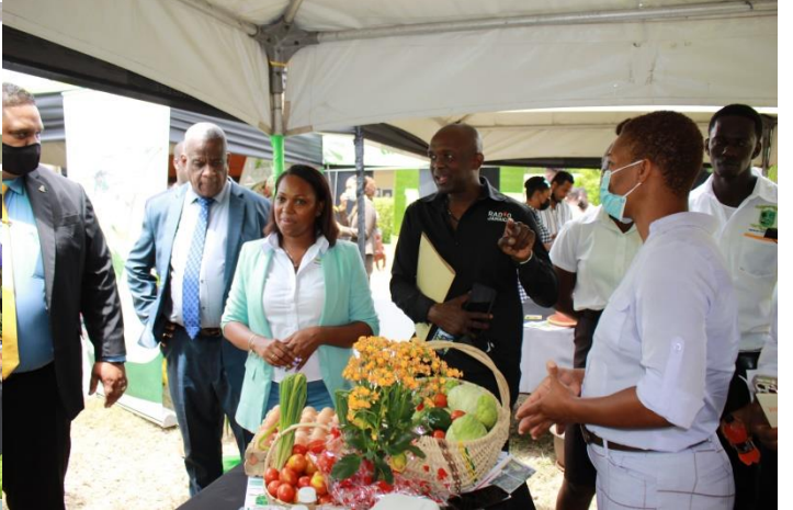
Ministers with responsibility for Agriculture from Jamaica and the Cayman Islands touring the display on International Day of Plant Health 2022 in Jamaica