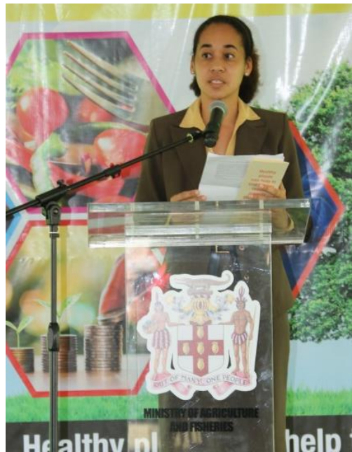
IICA Rep giving greetings at on May 12 at Jamaica's IDPH Celebration