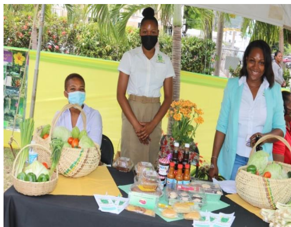
Tertiary Agricultural Institution displaying importance of Plant Health on May 12 at Jamaica's IDPH Ceremony