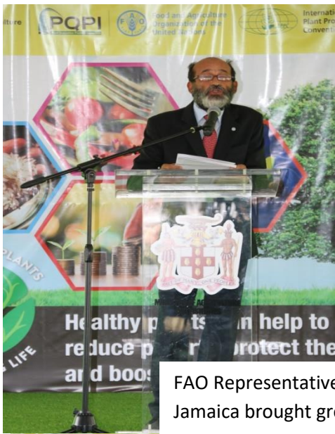
FAO Representative for Jamaica brought greetings.