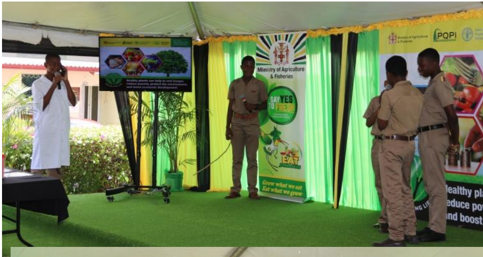
Drama Piece done by Wolmers Boys' High School on the importance of Plant Health to the Environment