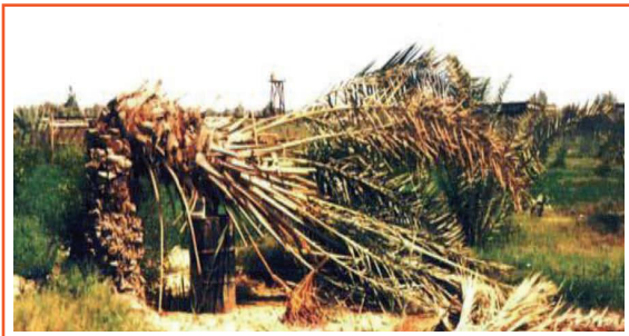
Death of Palm tree infested by the Red Palm Weevil.

Red Palm Weevil can devastate a coconut industry, destroying trees and causing severe financial losses for farmers and the national economy. RPW destroys coconut, date and royal palms all of which are critical to the landscape, beauty and appeal of the Caribbean's tourism product. Its impact on the tourism sector could be economically significant both in terms of loss of landscapes and the costs to operators to try to control the pest or replace trees.