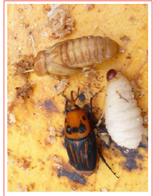
R.ferrugineus larva, pupa, and adult

The Red Palm Weevil can spread from one country to the next through the movement of infested palm material. Within a country, the red palm weevil can easily spread as adult weevils are strong fliers and can fly up to 900m (about 900 yds) at a time and can travel up to 7 km in 3-5 days.