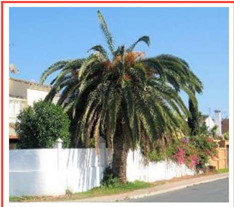
Initial Palm Weevil Infestation